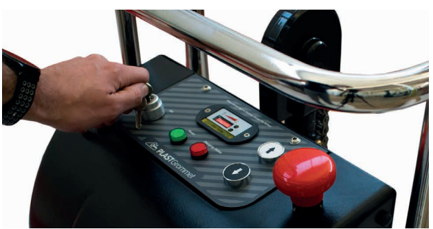
As simple as pressing a button. Effortlessly lift rolls pushing a button

Use Compact e-Lifter Pro to avoid back injuries and to load alone media rolls to the printer effortless.