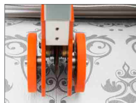
Single lengthwise rotary crush cutter (twin cutters optional)