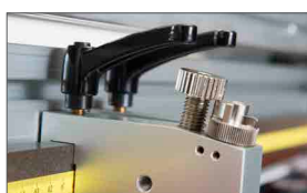
Fine pressure adjustment (according to the types of material)