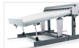
Can be fitted with: (optional): 1. Motorized Stacker in line with the cutter: height and inclination electronically adjustable; extensible length up to 3,2 meters 2. Folding collecting table 3. NEW Tilttable collecting table with wheels