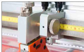
Fine positioning of the cutting blades (NEW standard)