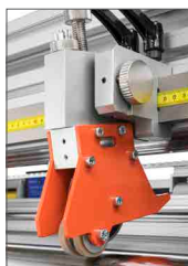
Slimline lengthwise rotary crush cutter, single or twin, (optional)